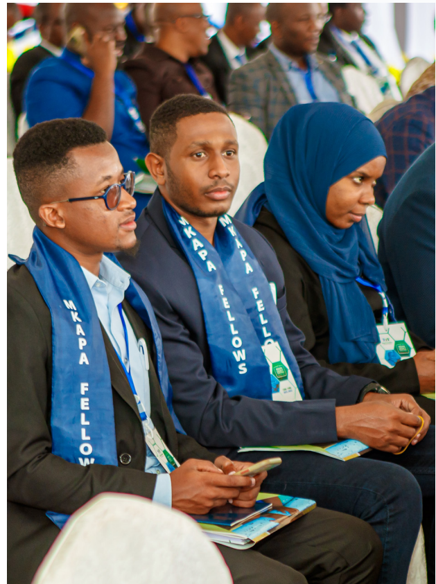
Representative of Mkapa Fellows (health professionals) in attendance as well as Community Health Workers