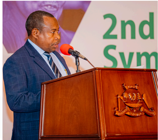
The Chief Guest- His Excellency Othman Masoud, 1st Vice President, Revolutionary Government of Zanzibar

Apart from recognizing BMF for being a trusted partner in improving healthcare in the country, the 1st Vice President noted that the government will continue providing an appropriate enabling environment for both public and private sectors, donor community and other stakeholders in PPPs on health sector and invest on innovative workable solutions that will transform healthcare systems to ensure no one is left behind.