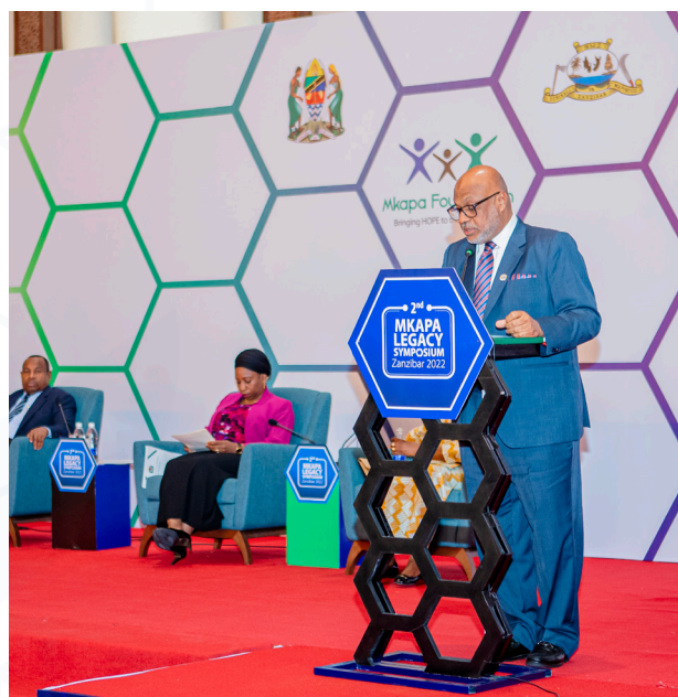
Minister for Health, Zanzibar, Hon. Nassor Ahmed Mazrui stressing a point during the panel discussion

Hon. Nassor Ahmed Mazrui, Minister for Health, Zanzibar joined previous speakers in celebrating the life of the late President Mkapa by informing participants how Zanzibar has been benefiting from BMF through human resources deployment. According to the Minister, the BMF has for the past 12 months, provided Zanzibar 105 staff of different health cadres who were distributed in primary health centers in Unguja and Pemba Islands. He added that the contribution was a milestone towards the Isle's mission and vision to strengthen healthcare by providing better quality services to the people.