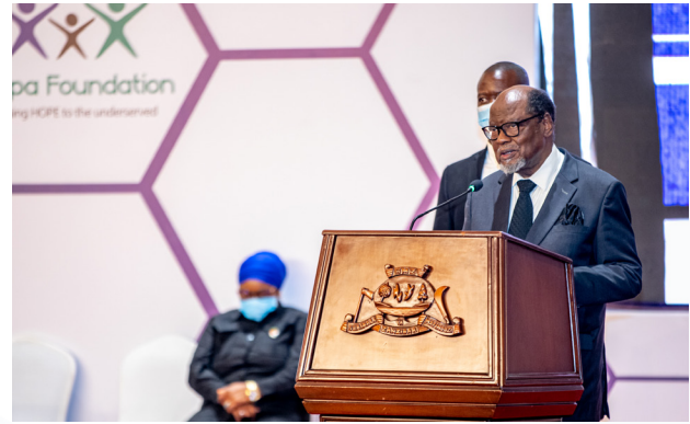
The former President of Mozambique, HE Joachim Chissano talked how he met the late Benjamin Mkapa and became lifelong friends.

The second period of interaction with "Ben" came a while after the proclamation of the Independence of Mozambique when he became the Minister of Foreign Affairs of Tanzania, between the years 1977 and 1980. Former President Chissano was already Minister of foreign Affairs of Mozambique from the 1st of July 1975. The duo later worked together when both were Heads of State. H.E. former President Chissano was head of State