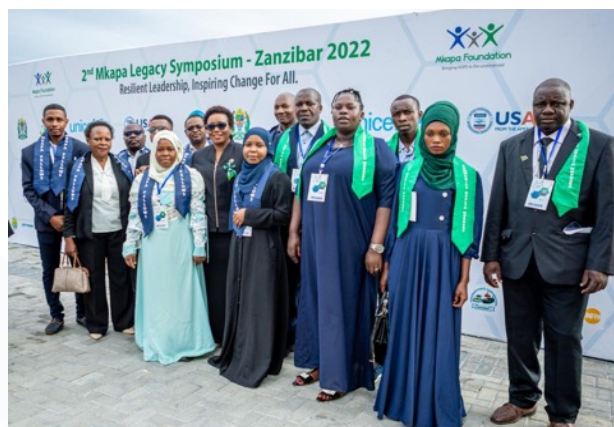
Mkapa fellows who attended the 2nd Mkapa Legacy Symposium