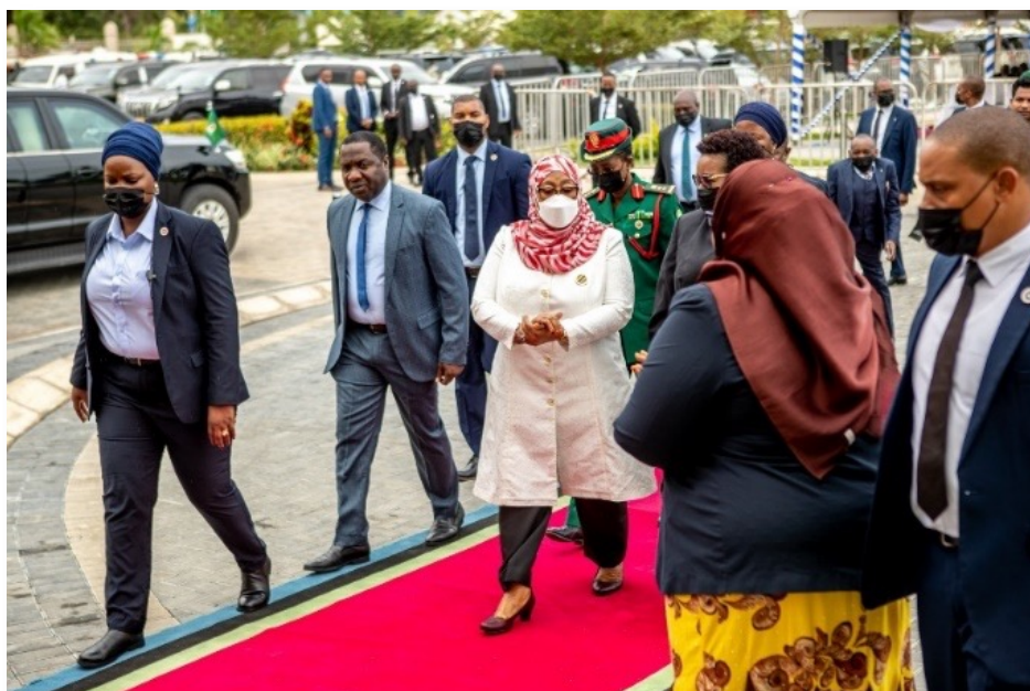
H.E. President Samia Suluhu Hassan entering the symposium venue