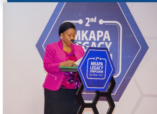
Hon. Umyy Mwalimu, Minister of Health, United Republic of Tanzania

She explained that the focus of the two panels aligned with the philosophy and desire of the late President Mkapa who established the Mkapa Foundation that has so far reached millions of Tanzanians focusing on improving rural health services, health and wellbeing of women and children including those living with HIV/AIDS, pregnant mothers, and others. The Minister said governments across the world are keen in using PPP to deliver infrastructure and services to meet huge demands of financing quality health services. The unique PPP model operationalized by the Foundation in collaboration with the Government, Donors and Private Sector has enabled innovative hiring of more than 10,000 health workers that have been deployed to the remote and needy areas of the country to ensure delivery of health care.