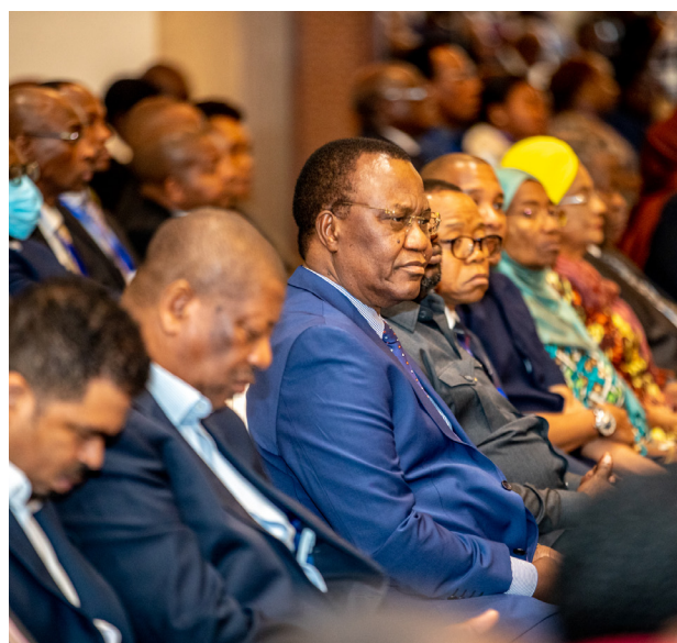
Hon. Mr. William Lukuvi, Member of Parliament, and other dignitaries listening to the welcoming address