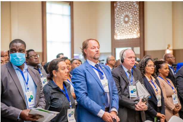
International delegates from UN agencies and other organizations graced the occasion

The United States of America Ambassador to Tanzania, H.E. Donald Wright spoke on behalf of fellow Ambassadors, High Commissioners, and development partners in Tanzania. The Ambassador referred to the late Mkapa as a true champion of global health, a developmentalist, a regionalist, a globalist, and a great statesman. He noted that the United States is proud to be a partner to the United Republic of Tanzania as the two parties continue to work together towards President Mkapa's vision of creating healthy lives and well-being for all, in Tanzania and the rest of Africa. He commended the government of the United Republic of