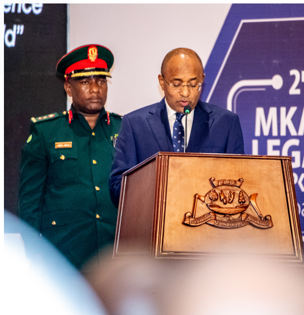
HE Dr. Hussein Ali Mwinyi, President of Zanzibar, Chair of the Revolutionary Council and Settlor of the Mkapa Foundation

He thanked all stakeholders who have made it possible to raise a total of TZS 1.2 billion during the fundraising event for the Mkapa Foundation Endowment Fund and requested partners and stakeholders to honor their pledges within a brief period. He said the funds raised will help strengthen the financial capacity of Mkapa Foundation and play a leading role in the implementation of the set plans to expand the scope of service delivery, especially in areas that were not receiving adequate funding.