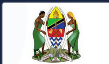
Government of the United Republic of Tanzania