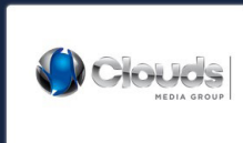
Clouds Media Group