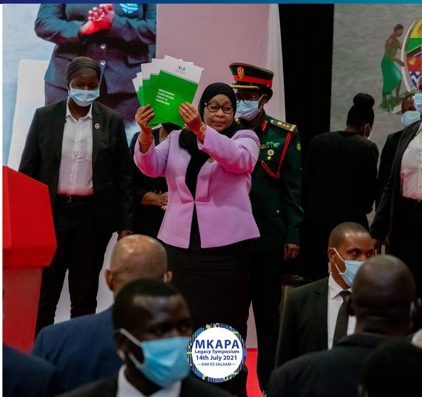
H.E. Samia Suluhu Hassan, President of the United Republic of Tanzania during the launching of the Mkapa Foundation Endowment Fund at the first Mkapa Legacy Symposium, July 14 th , 2021.

It was during this reporting period when the crucial decision of Settlor leadership replacement, was reached upon.